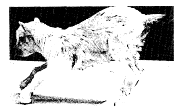
Figure 1 Newborn kid of a vanadium deficiency goat

In goats with vanadium deficiency, glandular or glandulocystic hyperplasia of the endometrium was