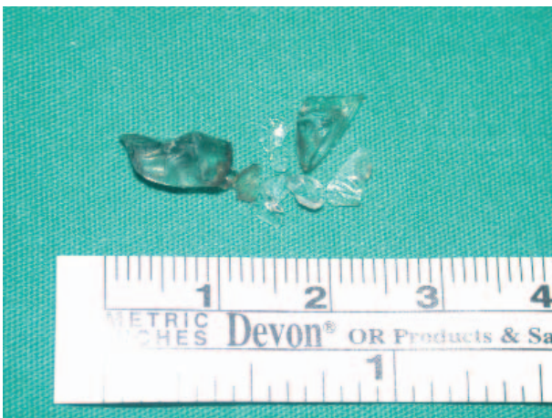
Figure 3. All glass particles were removed from the left frontal sinus.