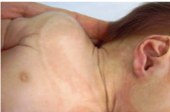
Figure 1. Asymmetrical streaks of linear hyperpigmentation that spread from the face to the neck, shoulders and chest.

G-banding chromosomal analyses of the patient and the parents were performed on cultured peripheral blood lymphocytes. The karyotype of the patient was 47, XX,+13[100], with no mosaicism. The karyotypes of the parents were normal. We could not perform skin fibroblast karyotype analysis due to technical reasons. While the routine studies of the patient were in process, she expired suddenly due to a cardiac arrhythmia.