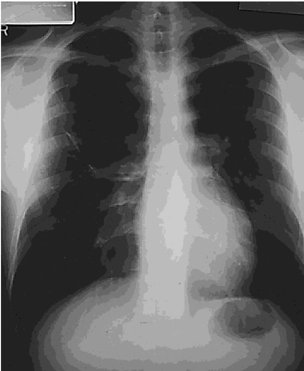
Figure 1. Chest radiograph (Case 1) showing small right apical pneumothorax with mediastinal emphysema and a large bulla in the right upper lobe.