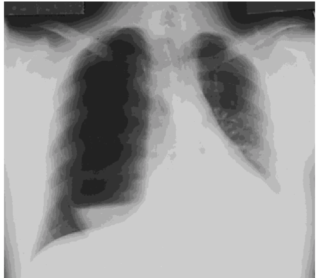
Figure 3. Chest radiograph (Case 3) showing large right pneumothorax with giant right upper lobe bulla containing fluid.

confirmed the persistent bulla in the right upper lobe. Unfortunately this became infected and was later resected at thoracotomy. He was allowed to fly home two weeks later.