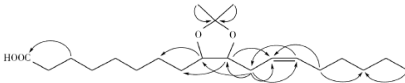
Fig . 2 The key HMBC correlations of compound 1