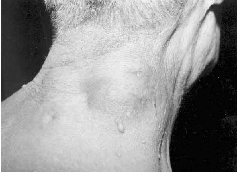
Figure 1. A firm, circular, slightly tender mass on the neck.