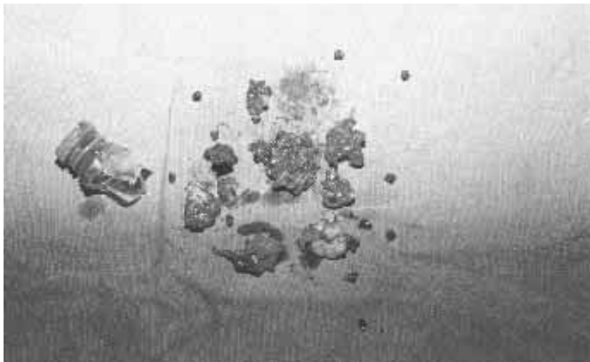
Figure 3. Debridement specimen from the neck.