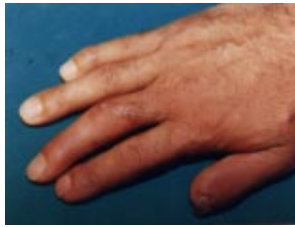
Figure 2. Another healed orf lesion on the finger.