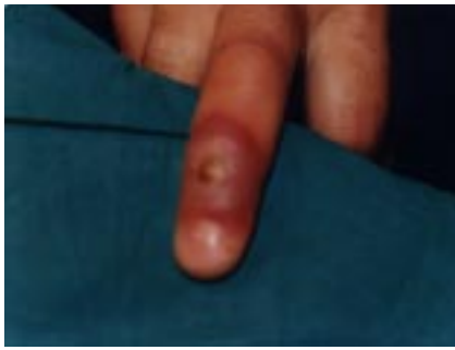
Figure 1. An orf lesion on the finger.