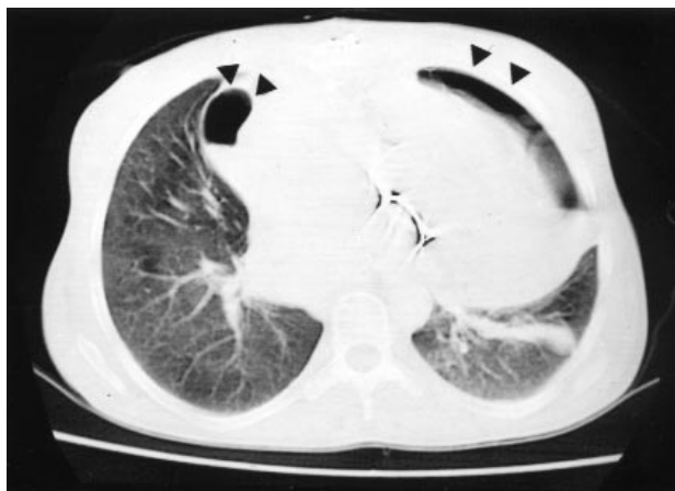
Figure 2. Computerized tomography showed bilateral airspace consolidation and pneumopericardium but no pneumothorax (arrow heads).