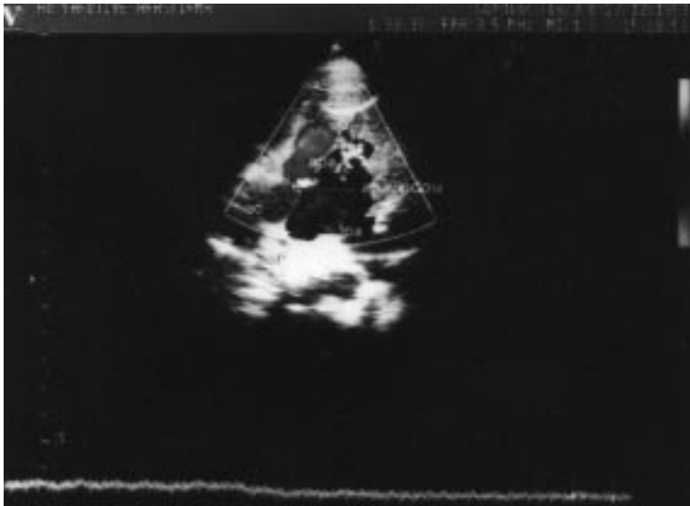
Figure 1. Preoperative echocardiogram of the patient. Parasternal short-axis demonstrates a large APW between the ascending aorta (ao) and pulmonary artery (pa). lpa= left pulmonary artery.