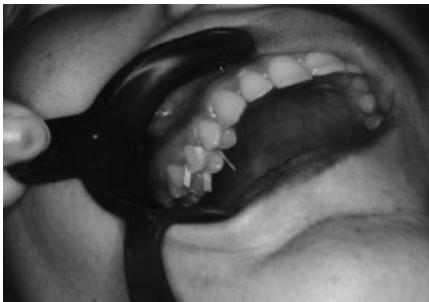
Fig. 1. A case depicting the GCF samples, which were collected with periopaper strips.

Prior to treatment, GCF was collected from the teeth which required artificial crowns and from the control teeth. They were isolated from saliva with cotton wool rolls and dried with short air blasts. GCF was collected with periopaper strips (Periopaper, Proflow Inc. Amityville) (Fig. 1). The pre-weighed strips (2 mm x 7 mm) were left within the sulcus for a standardized period of three minutes. The amount of GCF on the strips was measured by weighing the accumulated fluid (7). The strips containing GCF were placed in pre-weighed, sealed plastic tubes and weighing was repeated immediately