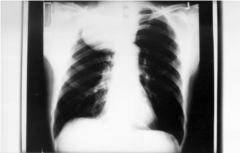
Figure 1. Chest x-ray of the patient showing a well circumscribed mass at the extreme apex of the right lung.

Key Words: Pancoast tumor; mesenchymal tumor; malignant hemangiopericytoma