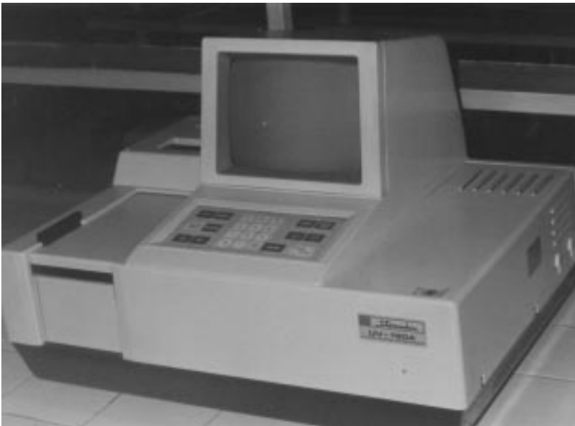
Figure 3. Spectrophotometer instrument.

restorations with a one millimeter peripheral margin of tooth remained exposed (Figure 2).