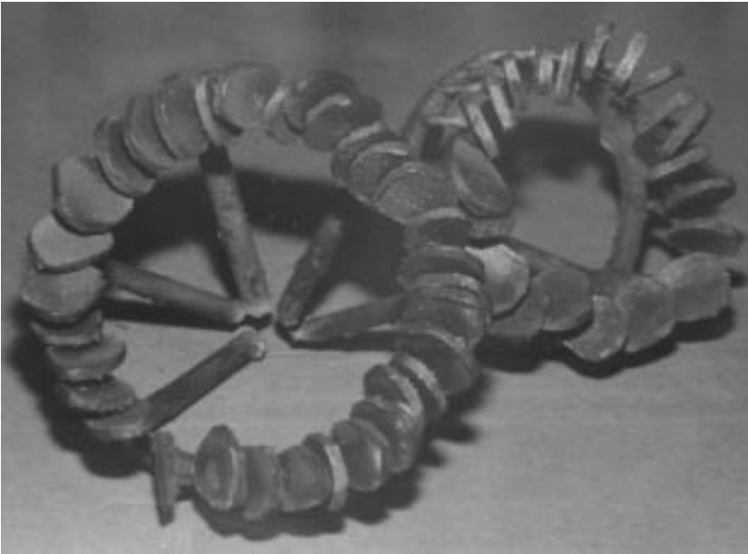
Figure 1. Casted metal discs.