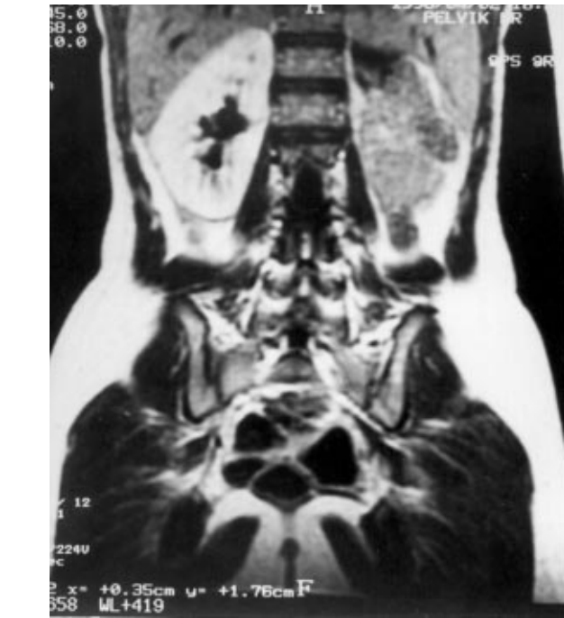
Figure 1. T1-W coronal image. Left renal agenesis and enlarged right kidney.

Pelvic ultrasonography demonstrated two separate uterine bodies and a cystic mass of 38x23x25 mi-