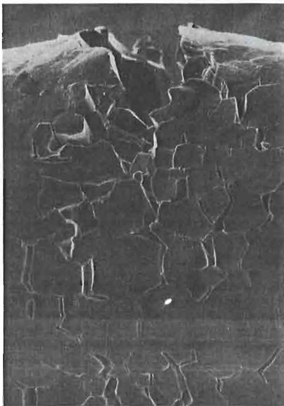
Intergranular stress corrosion in a 9 carat gold alloy after exposure under a tensile stress of 120 MPa to 2 M hydrochloric acid solution at room temperature x 380