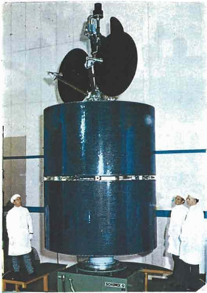
Fig. 2. The Intelsat IV telecommunications satellite, the most advanced in service, has the capacity to relay twelve television channels and 9,000 telephone circuits throughout its designed seven-year life. Power for these relays is provided by over 40,000 silicon solar cells, which together generate 569 watts dropping to 460 watts at a constant 23.8 volts. Each cell incorporates a gold current collector grid on its front face and a gold contact area on its reverse

by both the United States and the Soviet Union. The banks of solar cells have become familiar features of illustrations of such vehicles. The solar panels either cover the bodies of the satellites or form paddle arrays on booms attached to the bodies of the deep-space probes.