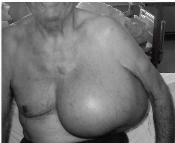
Figure 1. The hard mass which extends from the chest anterior wall to the left axillary.