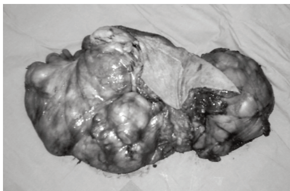
Figure 3. The macroscopic image of the specimen after resection.

Intraoperative frozen section analysis confirmed the mass to be a liposarcoma, and a wide resection, with 2 cm intact tissue around tumor border, was performed (Figure 3). Histopathological examination determined that the mass was a high-grade undifferentiated liposarcoma containing atypical lipoblasts, weighing 9 kg, 50 \times 27 \times 12 cm in diameter, and with 50% necrotic areas. Owing to the fact that the surgical borders were negative, re-excision was not performed. The patient had no recurrences during the