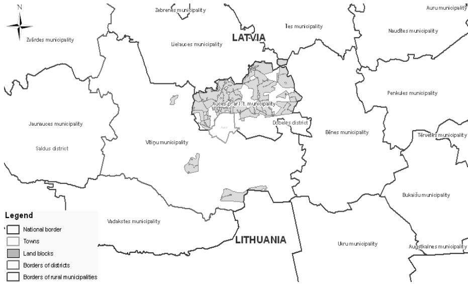
Fig. 2. Land blocks declared for EU support by LUA Training and Research Farm “Vecauce.”