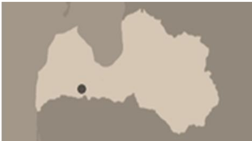
Fig. 1. Location of the simulation research in Latvia.

For the research of GM oilseed rape quality inspection and monitoring performance, data on the field blocks of the LUA Training and Research farm “Vecauce” are used; these have been declared for EU support. In the field blocks, the conventional rape occupies 290 ha of land with field sizes ranging from 4–102 ha in 2007 and from 6–79 ha in 2008 (Figs 1–2). Bee farms are located around the perimeter of the farm. In the neighboring parishes bordering Lithuania there are also conventional oilseed rape fields that have been declared for EU support.