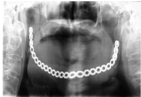
Fig. 5 The orthopantomography of post-operation The mandibular body was resected.

the anterior oral floor and infiltrating as far as the mandible. As he was seen in our clinic postoperatively, his initial TNM was unclear. Radiotherapy (total dose, 60 Gy) was used to treat the primary lesion. Four years later, an extending ulcer consisting of mandibular osteomyelitis (induced by radiotherapy) combined with acinic cell carcinoma was noted. The patient required a wide excision of the anterior aspect of the oral cavity, including amputation of the left mandibular ramus, and