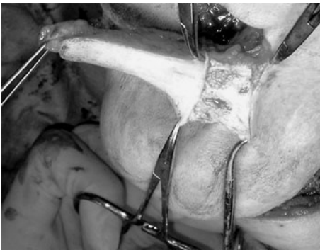
Fig. 3 The nasolabial flap that denuded one part of the subcutaneous tissue

functional points of view. This report describes the use of two types of nasolabial flap.