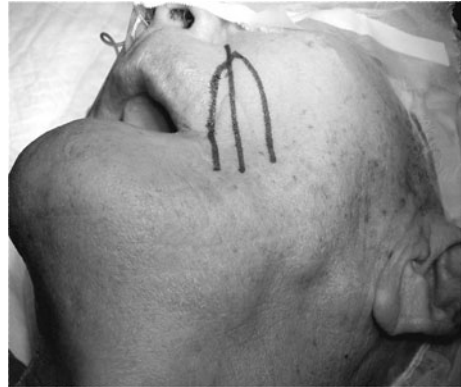
Fig. 2 The design of nasolabial flap is marked on left nasolabial folds. This flap is based inferiorly.