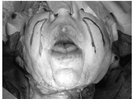
Fig. 6 The design of nasolabial flap is marked on bilateral nasolabial folds Each nasolabial flap is based inferiorly.

reconstruction of mandibular bone by metal plate. (Fig. 5).