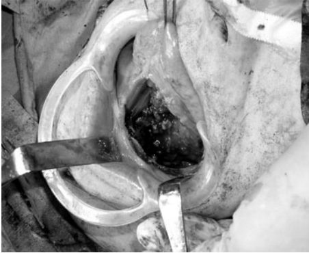
Fig. 1 Defect after resection of mucoepidermoid carcinoma on the left floor of the mouth