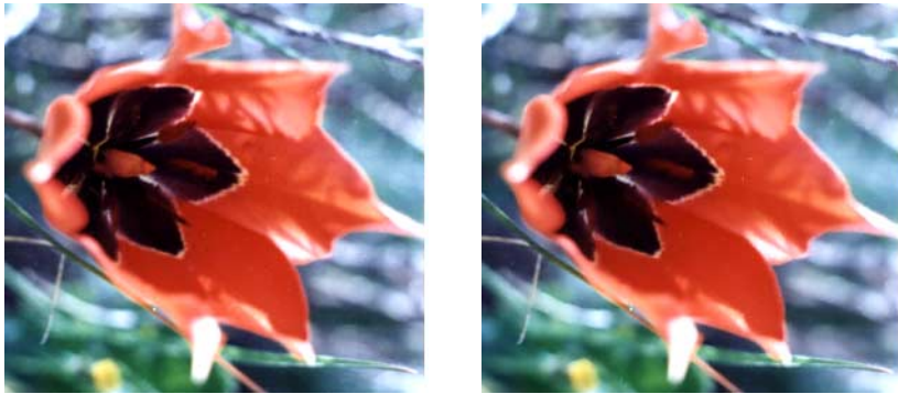
Fig. 2. Left - original tulip, right - enhanced and denoised tulip. 40 iterations, [k_f, k_b, w] = [0.7, 5, 3] * MAG, \rho = 1