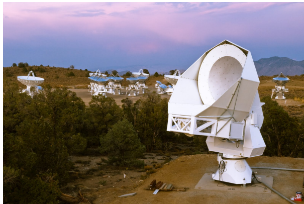
Figure 1: Picture of the POLARBEAR experiment with the Huan Tran Telescope, as of February, 2010, at the Carma site, California.

We describe the Cosmic Microwave Background (CMB) polarization experiment called POLARBEAR. This experiment will use the dedicated Huan Tran Telescope equipped with a powerful 1,200-bolometer array receiver to map the CMB polarization with unprecedented accuracy. We summarize the experiment, its goals, and current status.