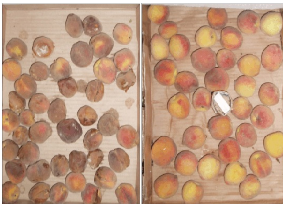
Fig. 3: Vapor effect by a sweet basil oil 3 ml/box under infestation by R.stolonifer 1= without treatment (control) 2 = treatment by sweet basil

sweet basil by vapor phase. Their effect was increased by increasing the concentration up to 20 ul/400cm 3 . Various essential oils have been found to possess varied degrees of fungal toxicity against different pathogens [2,4,6,7,16,23,25,26,10,24] .