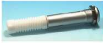
Figure 2. High voltage LEMO connector rated for 30kV DC. The female part only is shown.

side of the insulating stick. An outer conductor sleeve is placed onto it and connected to the ground surface of the HV connector. The sleeve is then fixed to the connector end with the wound metal wire, pulled and fixed in the same way at the open end.