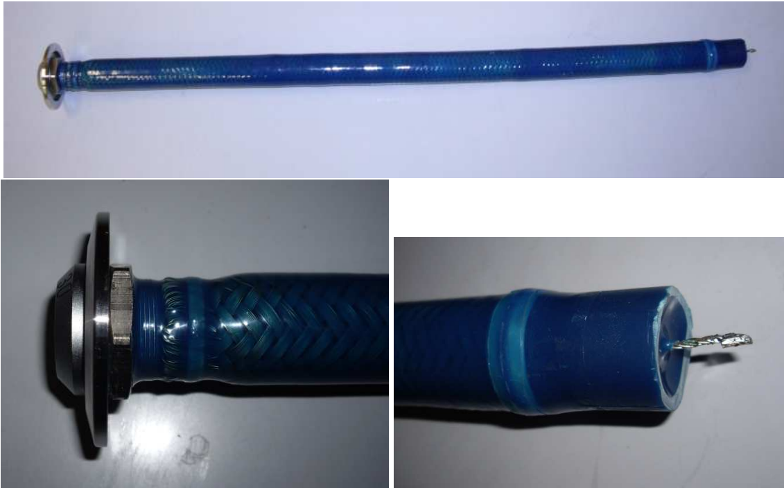
Figure 3. Photo of the assembled feedthrough, 70 cm long.

The unit is put into a slow ( \approx 60 rpm) rotation and another layer of the liquid polyurethane resin is deposited by a brush onto the sleeve. Slow rotation provides even distribution of the resin on the unit surface. Once the resin is cured, the rotation is stopped and the feedthrough is released. The resulting unit and its details are shown in Figure 3. Total curing time of the given resin is about 48 hours. After this period the feedthrough is ready to be mounted in a detector.