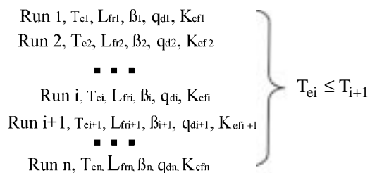
Fig 1. The grouping of initial data

3. Four files ( T_e, q_d, L_{fr}, \beta ) are formed by such principle that to the first values of parameters of the specified four files sizes for a route with the minimal value of the waiting time of return loading are appropriated.