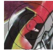
Fig. 1 A local image patch around a keypoint is divided into three sub-regions as above and a nearer region from the keypoint will be assigned a larger weight when extracting color features.

In the last step, the SIFT descriptor for luminance information and the three modified color descriptors are combined into a unified descriptor. Before the combination, since luminance feature and color feature have different importance in the process of image matching, the normalized SIFT descriptor and color descriptors are weighted by a factor of \lambda . So the final descriptor vector has the form (SIFT, \lambda * color) and 722 dimensions.