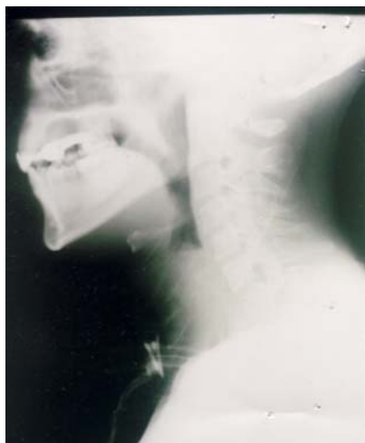
Fig. 1. Lateral radiograph of neck showing a transluminal obstruction above the tracheotomy site.

Laryngoscopy revealed a mass in posterior part of subglottic area below the posterior commissure that extended to the 3rd tracheal ring. Mucosal wall of trachea was intact.