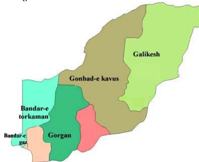
Fig. 2: Sites of collection of soil samples in five forests and farmyards at Golestan Province, Iran