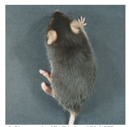
Figure 2. Photograph of EAE induced BL6/C57 mouse with paralyzed hind limbs and tail (score of 4).

Figure 1. Summary of disease pattern changes observed in EAE induced animals with different body weights. In 19-20gr body weight animals the increase in clinical scores (bottom panel) starts early after the immunization (2 dpi; day second post immunization) and corresponds well with the decline in body weight (top panel). In group over 20gr however, there is a delayed increase in clinical score as well as a delayed onset (12 dpi). In group under 18gr, there is a significant weakness of the animal which results in an early animal death (day 6 dpi).