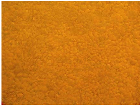
Figure 1. Monolayer of HeLa cell culture 72 h after addition of Betamethasone ( 40 µg/ml).