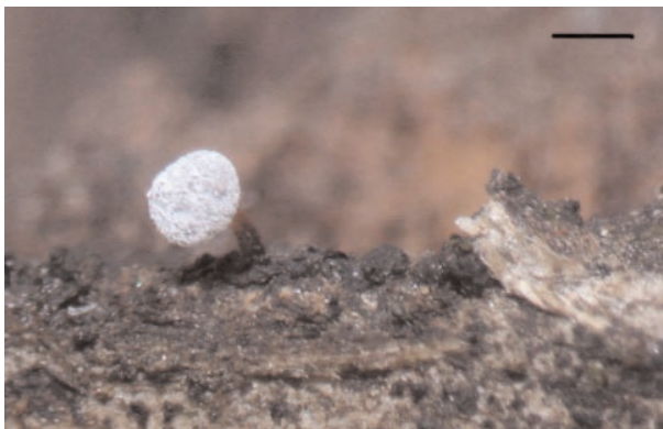
Figure 1. Stereomicroscopic image of the sporangium of Badhamia gracilis .