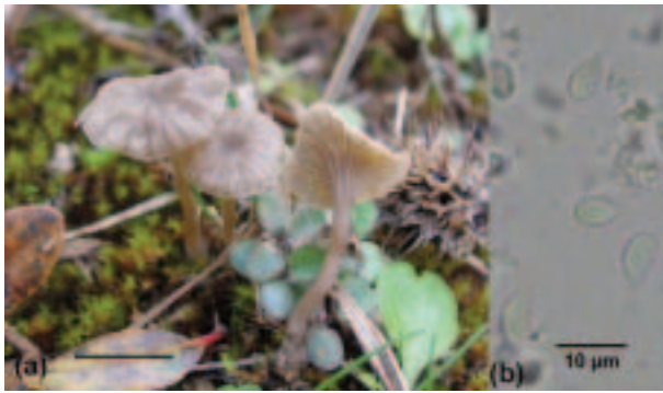
Figure 1. Arrhenia rickenii (a) basidiocarps and (b) basidiospores.

N, 36°15'20 E, 162 m, on moss covered ground, 05.11.2005, K.2959; Urfa, Bozova, Sam village, 37°28'05 N, 38°19'09 E, 537 m, 16.12.2007, K.5179.