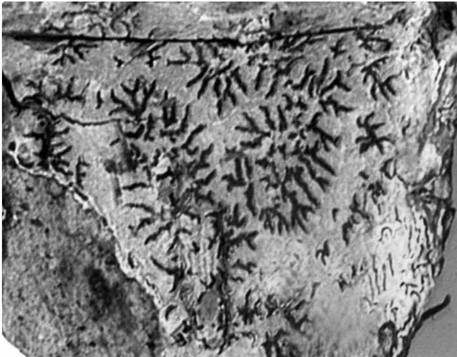
Figure 3. Phaeographis dentritica (Ach.) Müll. Arg., Habitus 25 mm.

Caloplaca aractina (Fr.) Häyrén C. chlorina (Flot.) H.Olivier C. crenularia (With.) J.R.Laundon C. irrubescens (Arnold) Zahlbr. Pannaria conoplea (Ach.) Bory on calcareous rocks: Caloplaca dolomiticola (Hue) Zahlbr.