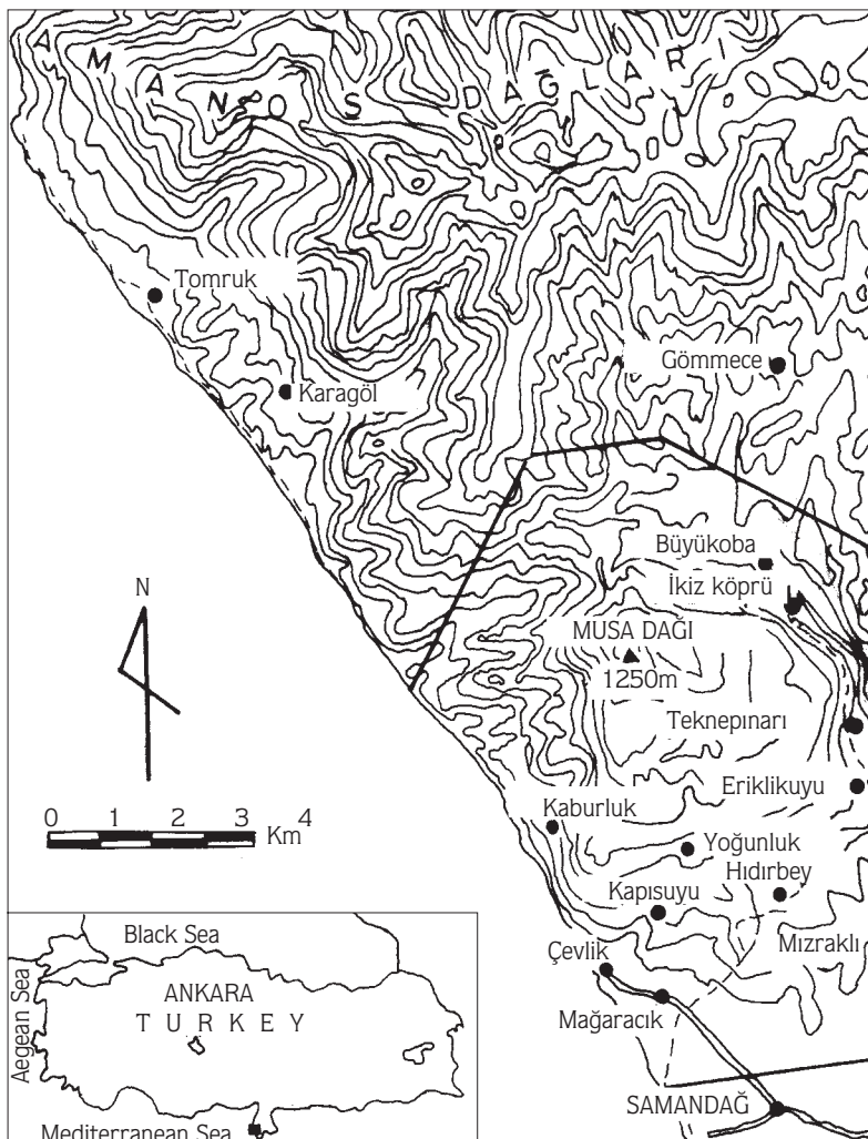
Figure 1. Topographical map of Mount Musa.

Research area has a typical Mediterranean climate. The annual average of precipitation is 1124 mm in Hatay and 937 mm in Samandağ according to the data obtained from Hatay and Samandağ meteorology stations. Snowfall rarely occurs between December and March. The annual average of temperature is 18.1 °C in Hatay and 18.8 °C in Samandağ. Rainy and humid climate is more effective especially in the deep valleys at the north, but, less rainy and drought conditions are common at the