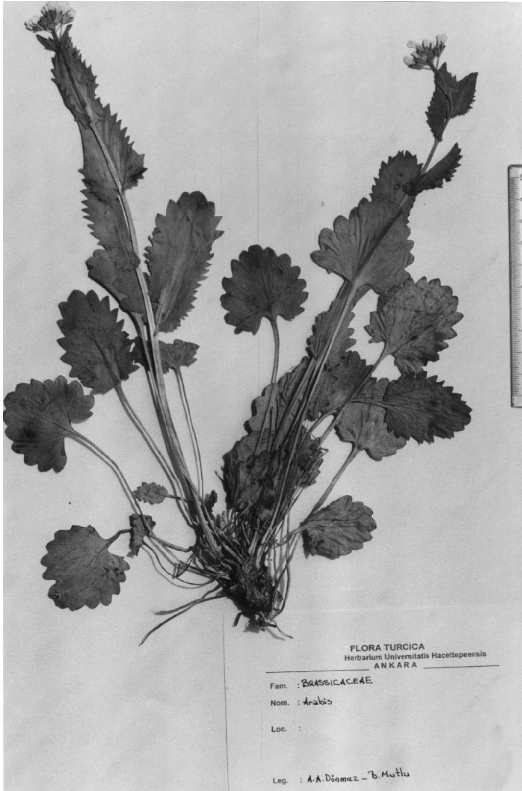
Figure 1. Arabis mollis a: habit, b: fruiting branch.