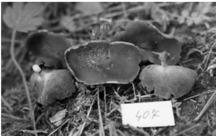
Figure 2. Cyathipodia villosa (Hedw. ex O. Kuntze) Boud.