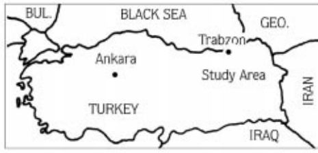
Figure 1. Map showing the geographical position of Altındere Valley National Park.