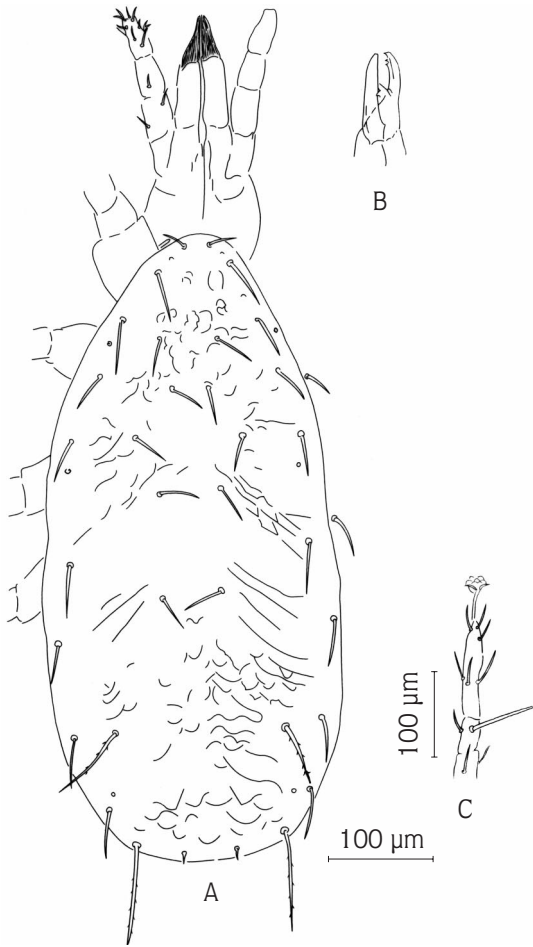
Figure 1. Amblyseius californicus (McGregor) Female: A) Dorsal view, B) Chelicera, C) Leg-4.