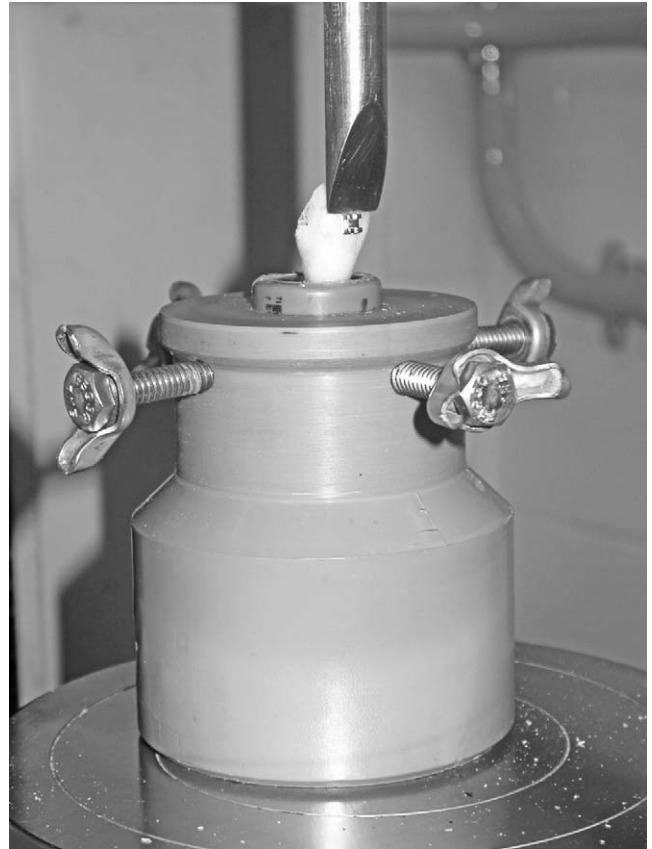
Figure 1. View of the bond strength test setup.

After prophylaxis, the teeth were randomly divided into seven groups ( n = 30 ) and stainless steel 0.018-inch maxillary central incisor brackets with a base area of 13.8 mm 2 (AbzilLancer, São José do Rio Preto, Brazil) were selected for the bonding procedure. TPSEPs (methacrylated phosphoric esters, Bis-GMA, initiators based on camphorquinone stabilizers, liquid 2 [yellow blister], water, 2-hydroxyethyl methacrylate, and polyalkenoic acid [Lot 261899D, date of expiry May 2008]) were mixed and activated, and each opened TPSEP was individually packed in small zipped bags and vertically stored, to avoid chemical degradation, inside an 8°C refrigerator. TPSEPs were kept activated for 30 (group 30), 21 (group 21), 15 (group 15), 7 (group 7),