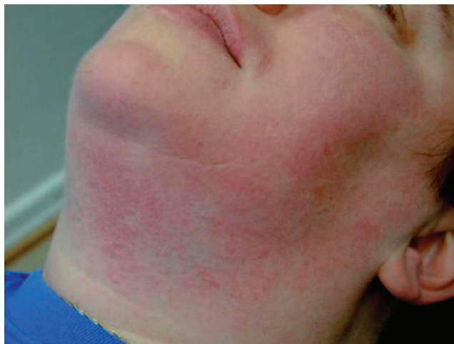
Figure 2. Allergic reaction on the skin caused by wearing the rapid maxillary expansion appliance (RME).

Patch tests for metals were performed at the dermatology clinic of the central hospital with 5% nickel sulphate (TROLAB E003 nickel sulphate 6 H 2 O in