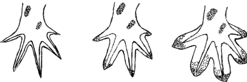
Figure 4. The structure of the foot webbing the rate of occurrence in the populations.