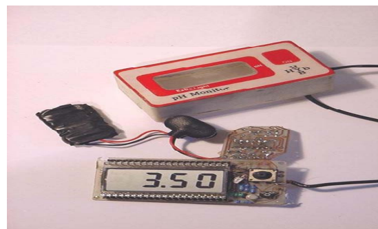
Figure 2. Picture of digital pH monitor