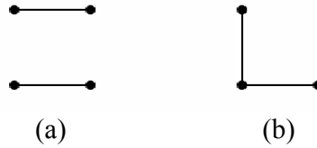
Figure 2. Graphs for models with two 2-factor interactions.