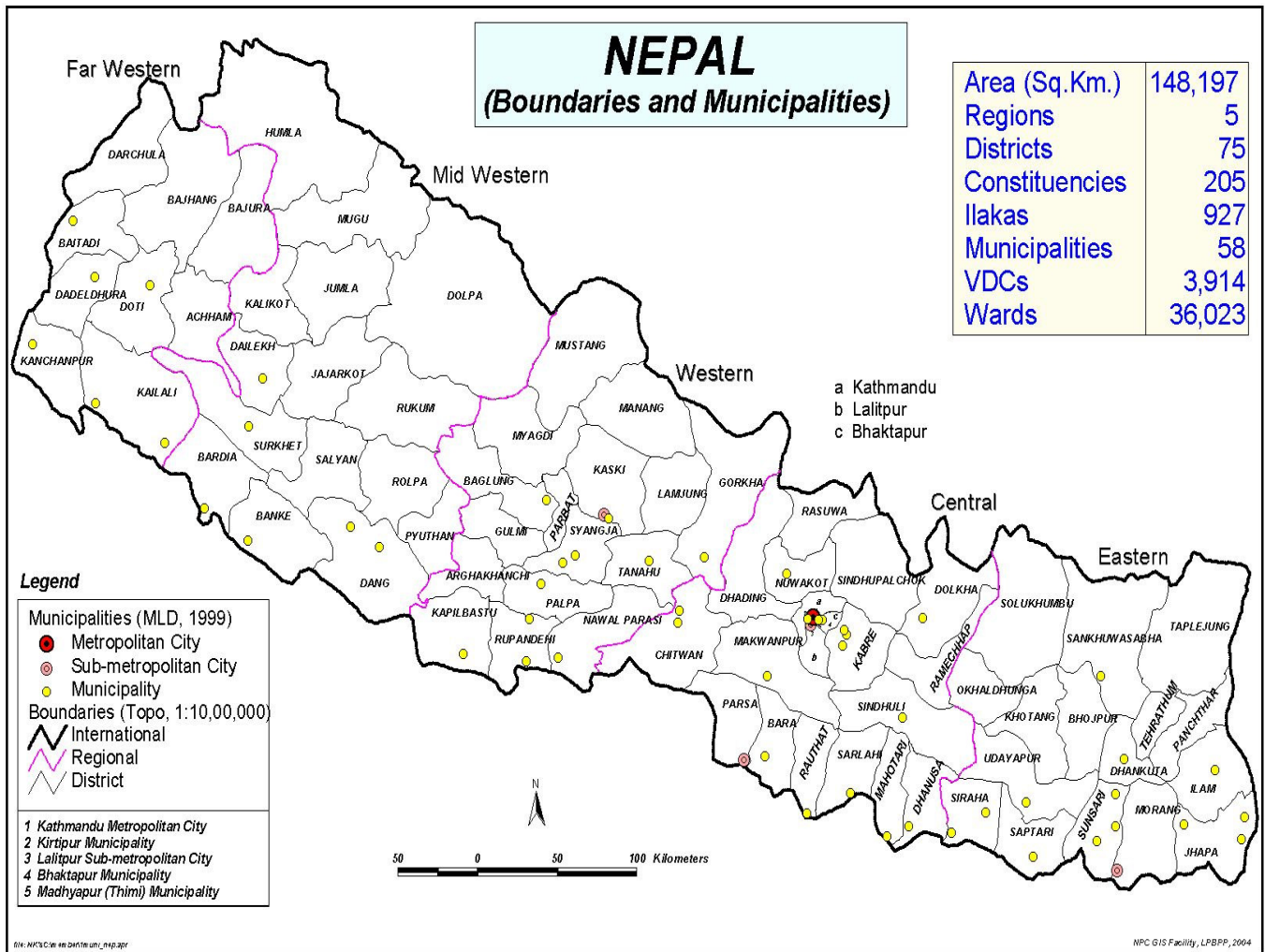
Figure 2. Current Administrative Structure of Nepal.