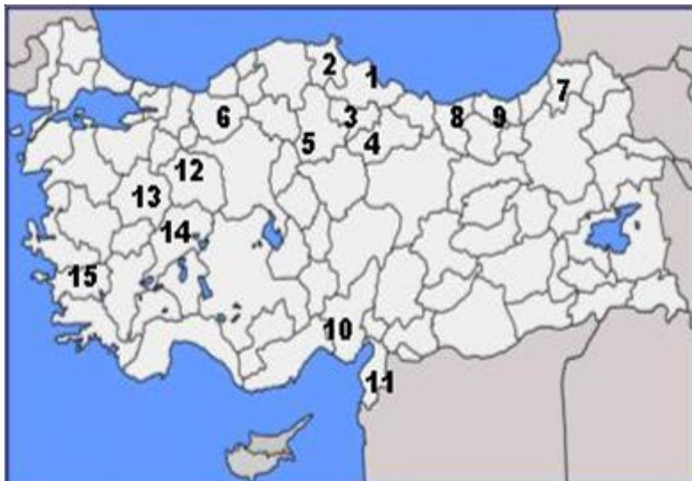
Figure 1. Provinces names and numbers from Table 1 correspond to the numbers in this figure.