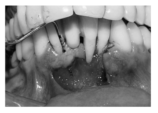
Fig. 2 Partial thickness dissection

The patient authorized the treatment to be performed, the use of images taken during treatment and follow-up appointments. Initially, the patient received periodontal treatment, including oral hygiene instructions and scaling and root planing. Four weeks later at her re-evaluation, good plaque control and no signs of active inflammation were observed. The combination of tunnel technique, SCTG and laterally positioned flap