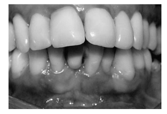
Fig. 6 Partial root coverage and favorable esthetic results observed at 12-month postoperative follow-up