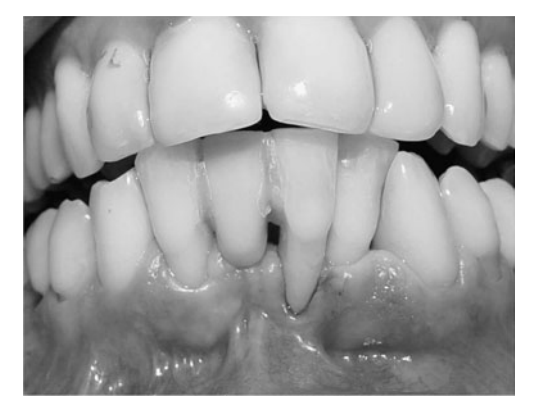
Fig. 1 At baseline, clinical examination revealed Miller class III recession and lack of attached tissue on Tooth #31 (lower left central incisor) and Miller class II recession on Tooth #42 (lower right lateral incisor)

central incisor) and Miller class II recession on Tooth #42 (the lower right lateral incisor) were also observed (Fig. 1). A probing depth of 1 mm was found for Tooth #31 with bleeding on probing, 7 mm gingival recession and an 8 mm clinical attachment level. A probing depth of 1 mm was found for Tooth #42, with bleeding on probing, 5 mm gingival recession and a 5 mm clinical attachment level. The possible etiology was considered to be incorrect tooth-brushing technique in combination with abnormal frenum attachment.