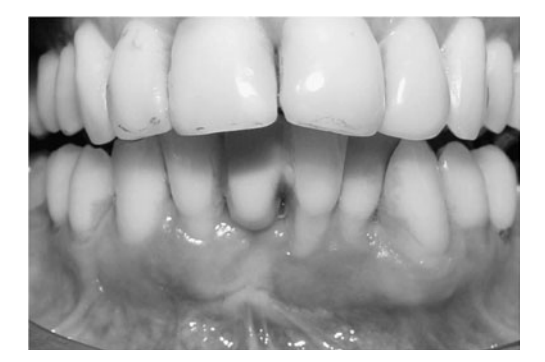
Fig. 5 Periodontal and esthetic conditions at 3-month postoperative follow-up