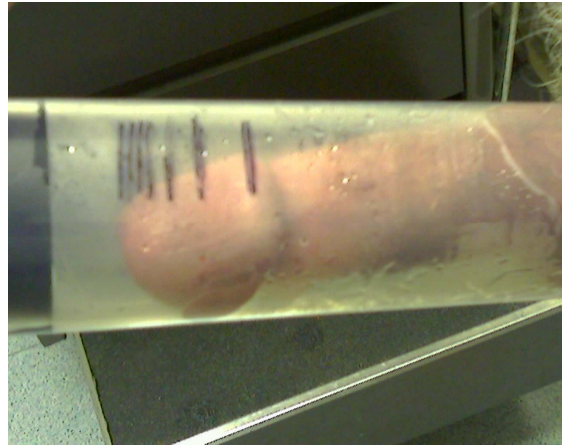
Figure 1. Photograph of patient marks on vacuum erection device. Note that weekly length gain is greatest during the first two weeks. Smaller gains continue up to eight weeks.

Not all patients wish to participate in the vacuum protocol. Some patients are eager to proceed with IPP implantation without delay. Others do not want to purchase the vacuum device. We attempt to convince these patients to participate in a truncated version of the program for only two weeks prior to surgery. We believe a period as short as two weeks will allow implantation of longer cylinders than would be possible without vacuum therapy,