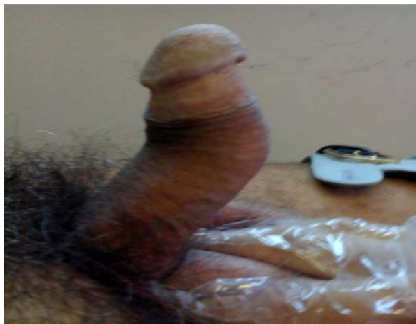
Figure 4. “s” shaped deformity of LGX cylinder.

Early in our observations we catalogued the various cylinder types manufactured by the two US companies to see if there was a difference in outcomes between the various cylinder models. AMS manufactures the LGX cylinder, which increases in girth to 18 mm and lengthens up to 20%. Coloplast Titan is a cylinder that is unrestricted in girth and length expansion. Only the tunica limits Coloplast cylinders expansion and length. We wondered if the lengthening cylinder or the unrestricted expansion cylinder would have different outcomes after our vacuum protocol. Satisfaction with outcome seemed