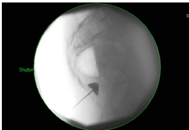
Figure 2. Injection of 1 ml contrast in lateral view.