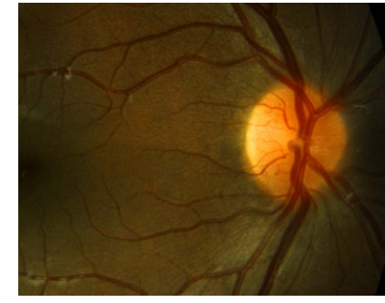
Figure 2. Healthy optic disc after treatment.

After Ixodes tick bite,following localized skin rash, within days to weeks spirochetes disseminate resulting in the presence of B.burgdoferi in blood, cerebrospinal fluid, heart, retina, brain, muscle, bone, spleen, liver and meninges of patients leading to a variety of symptoms [4,6]. Stage 1 of disease occurs from days to weeks after tick bite and characterized by typical rash of Erythema migrans[1]. Stage 2 of disease occurs from weeks to 6 months and characterized by radiculitis, meningitis, peripheral facial nerve palsy, encephalitis, myelitis, myalgia, arthritis, myositis, iritis, myocarditis, pericarditis and multiple erythemas [1]. Stage 3 of disease occurs after 6