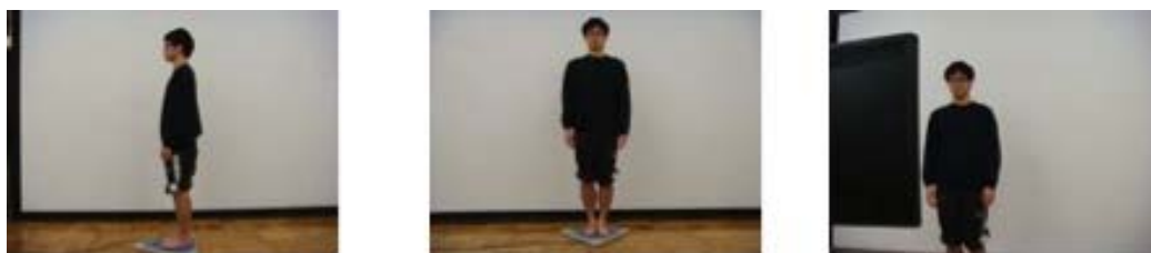
Figure 1. Posture of the subject during the test.

Figure 3 shows the means, standard deviations, one-way ANOVA, and ICC of all five trials and of the first three trials based on data pooled of males and females. The mean of five trials showed insignificant difference, and the ICC of the above trials was 0.68 and 0.75, being somewhat higher in the latter. Table 2 shows the means of three trials after excluding maxi-