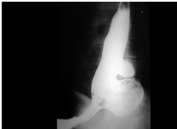
Figure 1. pre-operative barium swallow. Preoperative barium swallow demonstrates two simultaneously occurring epiphrenic esophageal diverticula. The proximal diverticulum is situated 1 cm above the upper margin of the neck of the distal diverticulum.

myotomy was carried out 180 degrees away from the suture line, extending onto the stomach for 2 cm. and as far proximally as the arch of the aorta ( Figure 2 ). A modified Belsey fundoplication was added. The postoperative course was uneventful. Postoperative barium swallow showed a regular transit of the contrast through the LES and few tertiary contractions in the lower esophagus. Manometry was performed at 6 months and showed the UES and LES with a tone of 56 and 8 mmHg respectively, and the absence of contractions in the distal esophagus. She remains well at 10 years with no recurrence of symptoms.