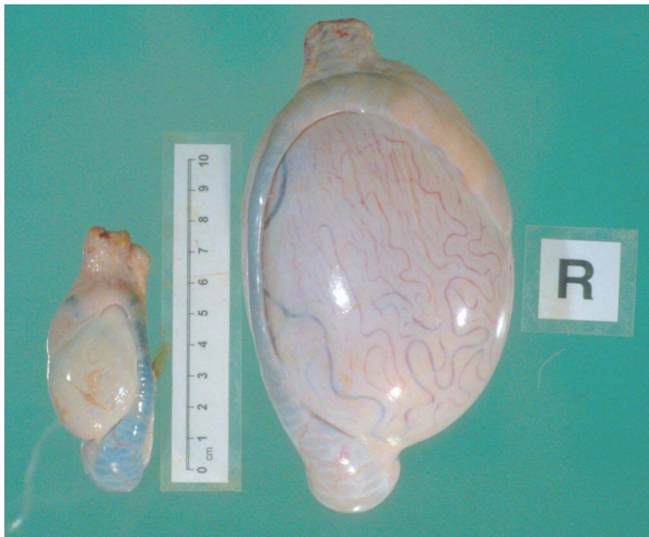
Figure 1. Normal right testis (R) and cryptorchid left testis, located at the entrance of the internal inguinal ring, from an adult ram. The cryptorchid testis is small and relatively elongated, the body of the epididymis is shortened; slight melanin pigmentation of the epididymis is an incidental finding.